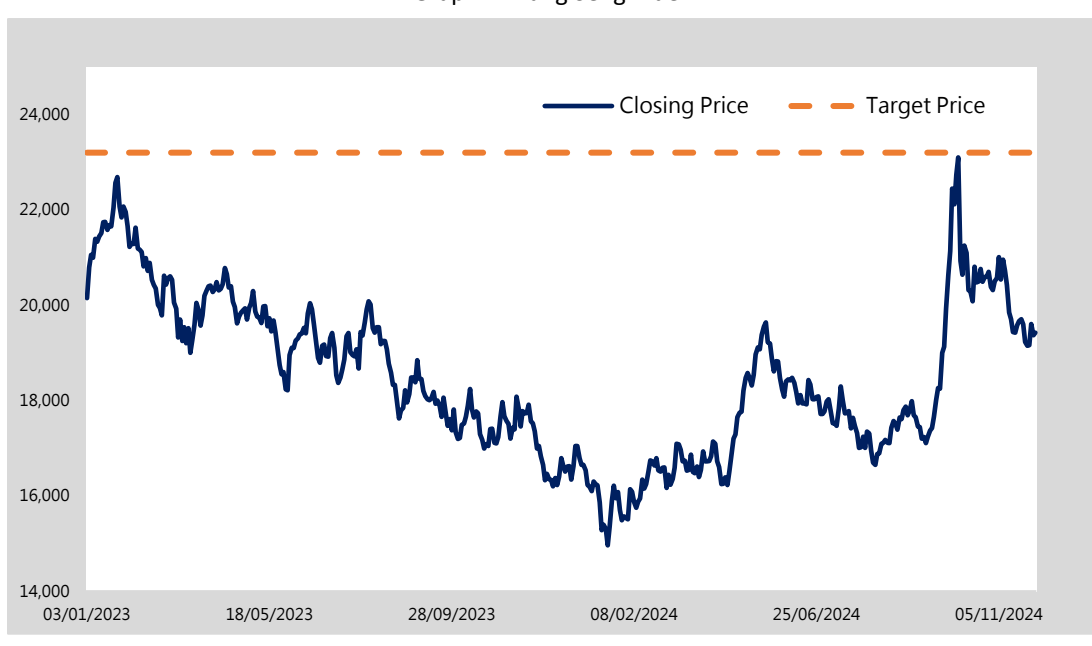
Graph 2: Hang Seng Index

This scenario is based on the following key assumptions: (i) the scale of economic stimulus measures aligns with expectations and focuses on private consumption, (ii) EPS growth for the HSI maintains >5%, and (iii) the China-U.S. conflict is confined to trade-related issues only.